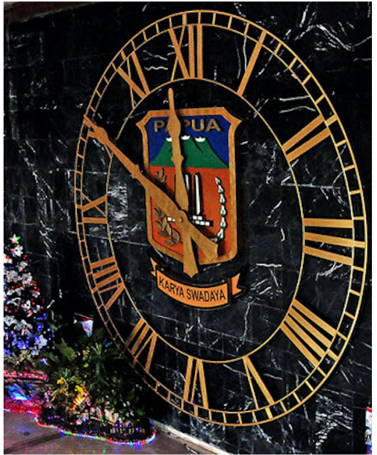
Jam Besar diameter 650CM di loby kantor Gubernur Papua di Jayapura dibangun pada tahun 2014