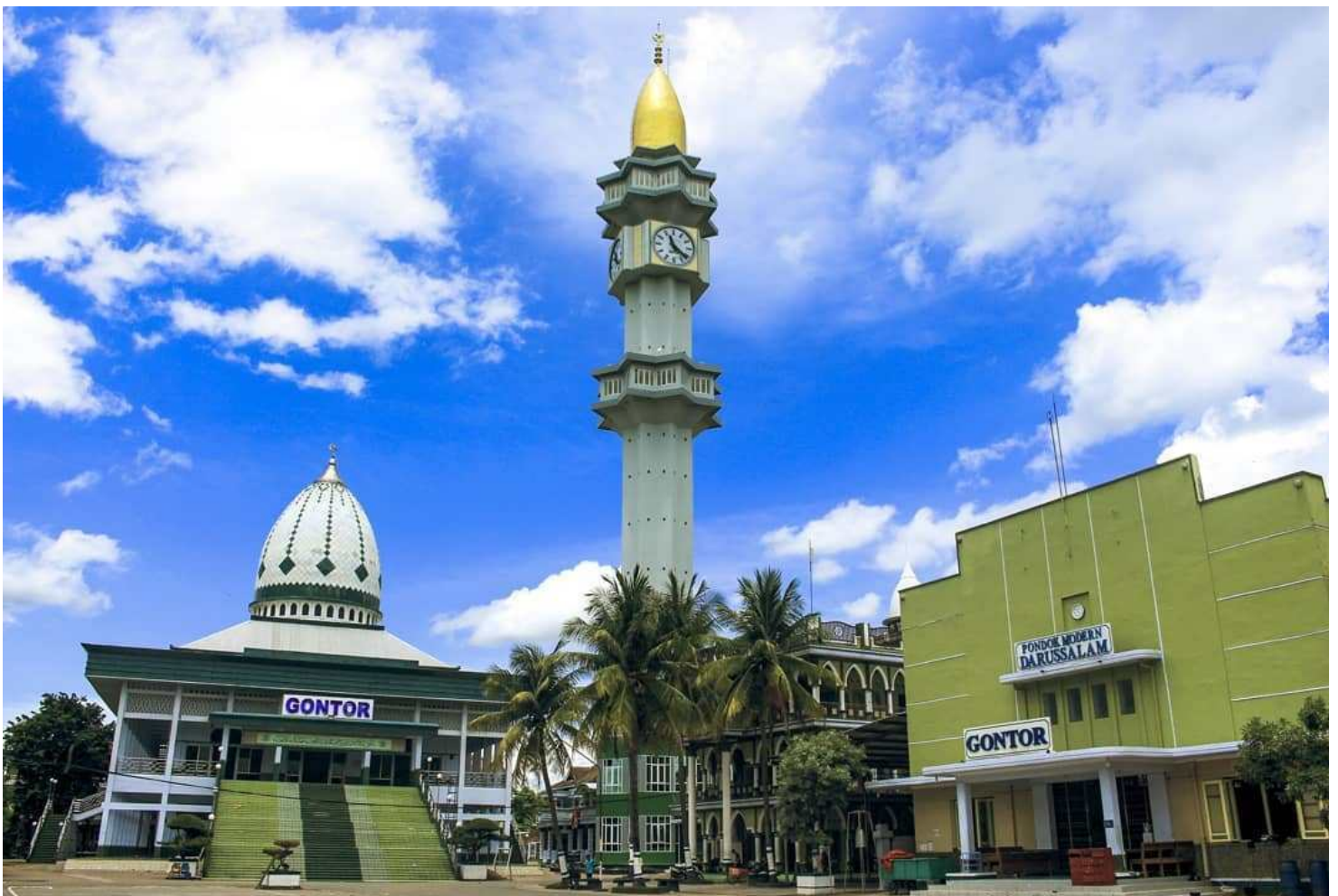
Menara Masjid Jami Gontor dibangun dengan ketinggian 85 meter, dilengkapi dengan 4 jam analog ukuran besar dengan diameter jam 4 meter di empat sisi arah mata angin.

Peletakan batu pertama dilaksanakan pada tahun 2016 oleh Bapak Presiden RI dan Pimpinan Pondok, peresmian dilakukan oleh Bapak Jusuf Kala, tahun 2018