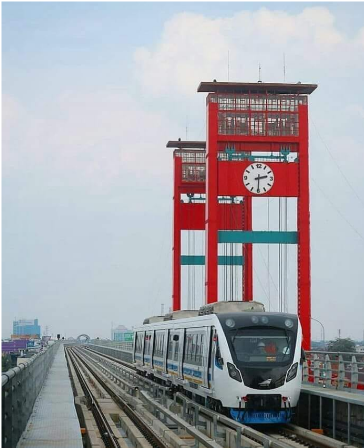
Asian Games XVIII Palembang, Jembatan Ampera Project: Kementrian PUPR, 2 Agustus 2018